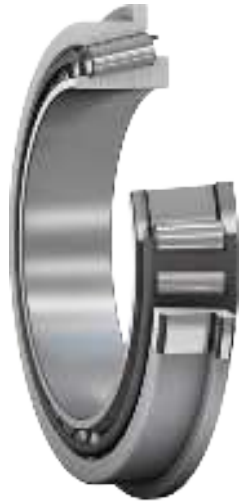
Flanged tapered roller bearings with outer ring coating

In addition to the standard range SKF can offer special coated ring designs, large size bearings and bearing units.