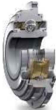
Traction motor bearing units with inner ring coating