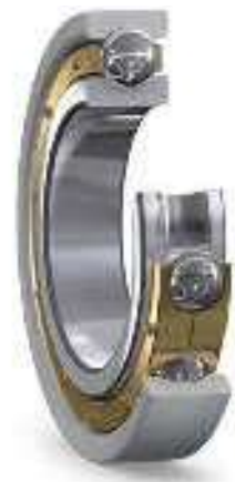
INSOCOAT deep groove ball bearings with outer ring coating