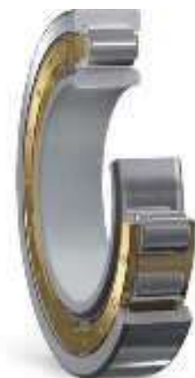
INSOCOAT cylindrical roller bearings with inner ring coating