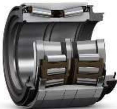
Tapered roller bearing units with outer ring coating