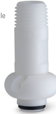
TankJet 30473 tank cleaning nozzle