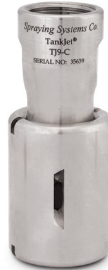
TankJet 9-C tank cleaning nozzle, see page D20