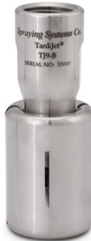
TankJet 9-B tank cleaning nozzle, see page D20