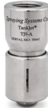
TankJet 9-A tank cleaning nozzle